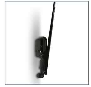
5 fixed tilt positions up to +15°