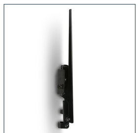
Low profile design mounts screen only 44mm (0.8") from wall