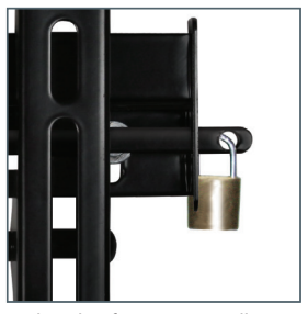
Locking bar for secure installation*