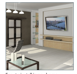
Easy to install in any home